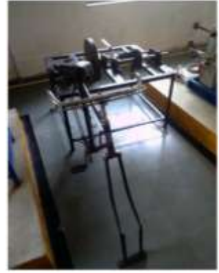
Fig: Project Diagram